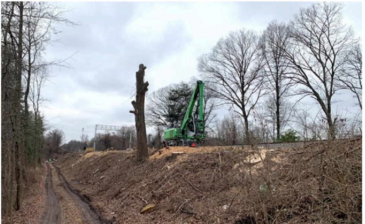
Tree clearing underway for the Franconia to Lorton Third Track