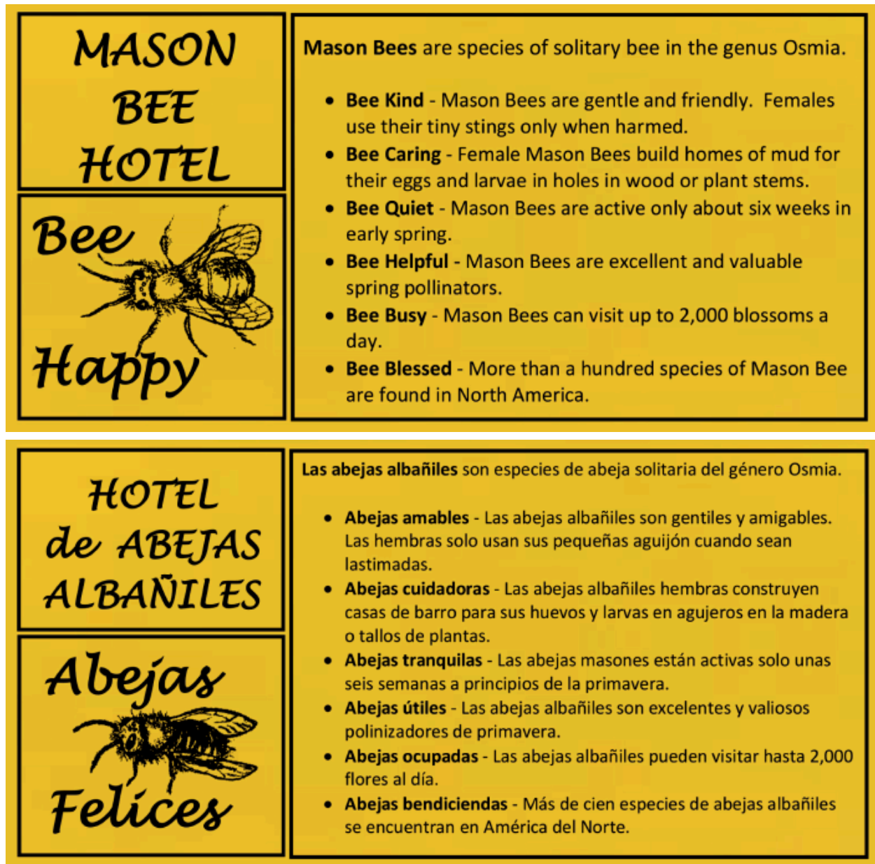
Bee hotel signs