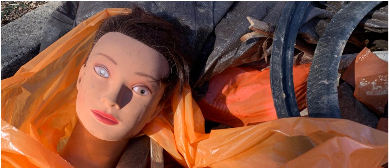
Weird discovery on Americana Drive